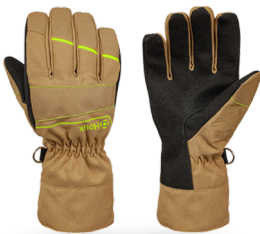
DIAMOND EASY BEIGE