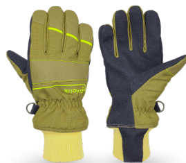
DIAMOND SHORT BEIGE