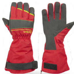
DIAMOND LONG RED